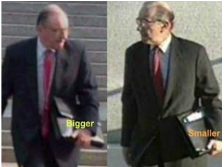
Analysis used of Alan Greenspan's briefcase

Today, the steady stream of public comments from Fed officials through interviews, speeches, and symposiums offers greater insight into their thinking than the mythical, albeit entertaining briefcase indicator. In fact, the only mystery surrounding the most recent Federal Reserve meeting was not whether rates would be cut, but by how much. While the announcement of a 50-basis point (.005) reduction was less expected than the conventional 25-basis point (.0025) move, the markets absorbed the news without major disruption.